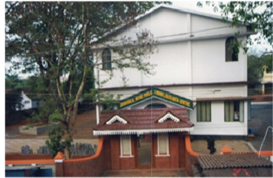
Jawaharlal Nehru Public Library

The location of libraries in the Corporation area shown in Figure.18.2 indicates that most of the libraries are concentrated in the Kannur zone.