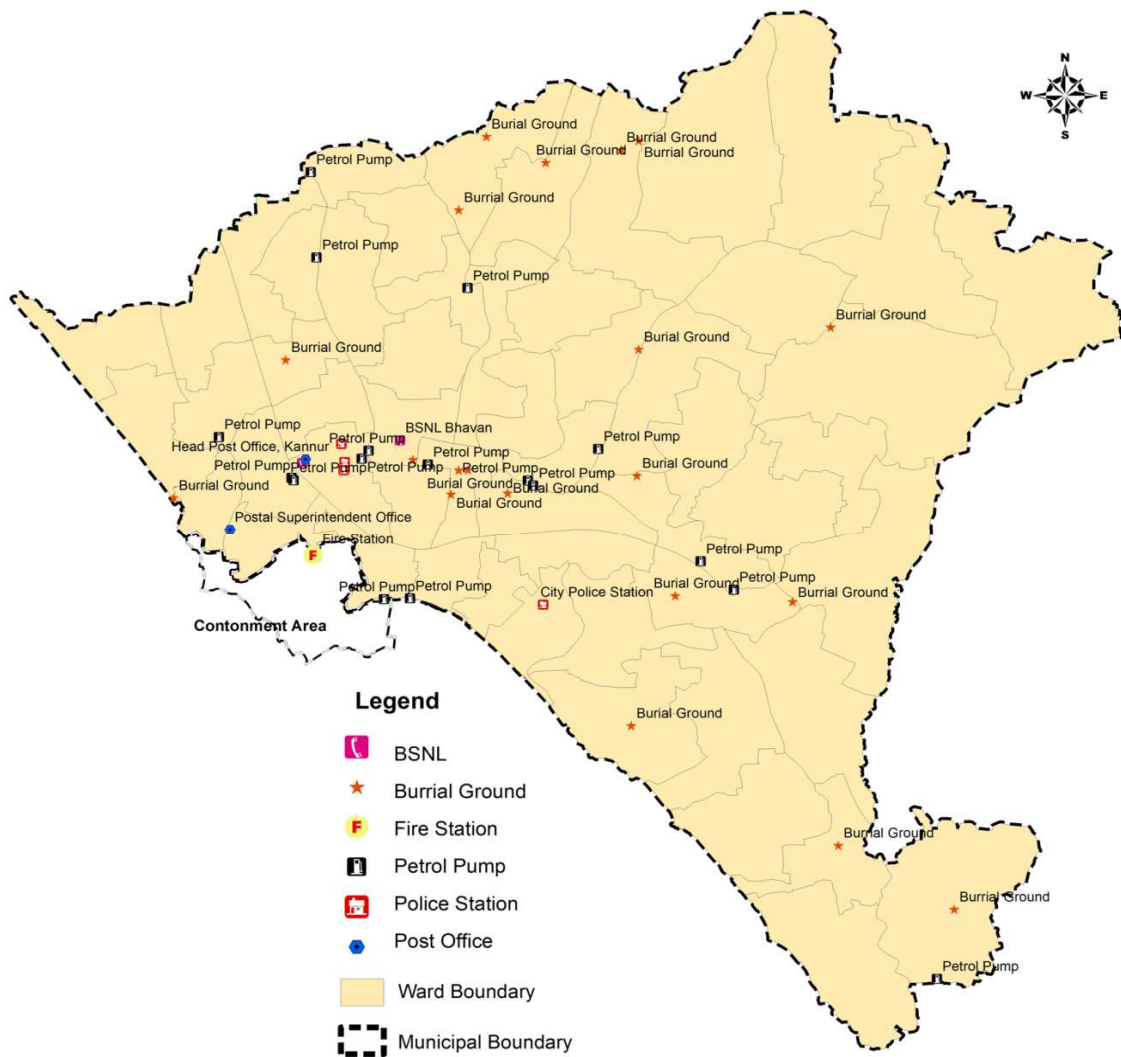
Figure.18.3 Location of civic amenities in the Corporation area

In the planning area, Town Police Station, IG Office, SP Office, Traffic Police Station, Police Control Room and Kannur City Police Station are located in the town wards. The Fire station is located in the Cantonment area.