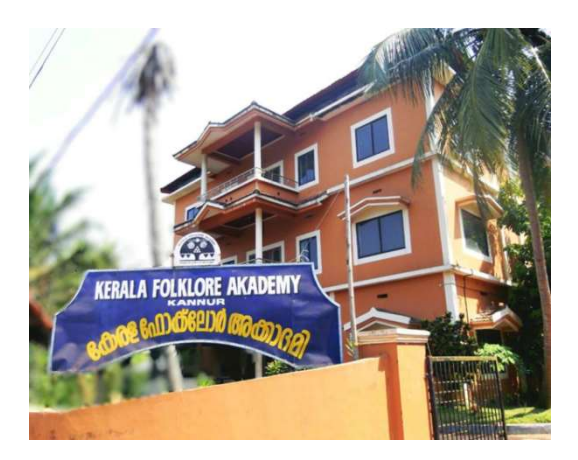
Kerala Folklore Academy

Folklore Kerala Academy, an independent centre for cultural affairs, was established on 28 June 1995. The main objective of the Academy is to promote and protect the traditional art forms of Kerala. Kerala Folklore Academy, an autonomous centre for cultural affairs, is located about 7 km away from Kannur. The institution was constituted by the Government of Kerala and functions under the Cultural Affairs Department, Government of Kerala. The institution provides financial assistance to folk artists. Economic aid programs and academic councils are conducted to promote the traditional Kerala art forms.