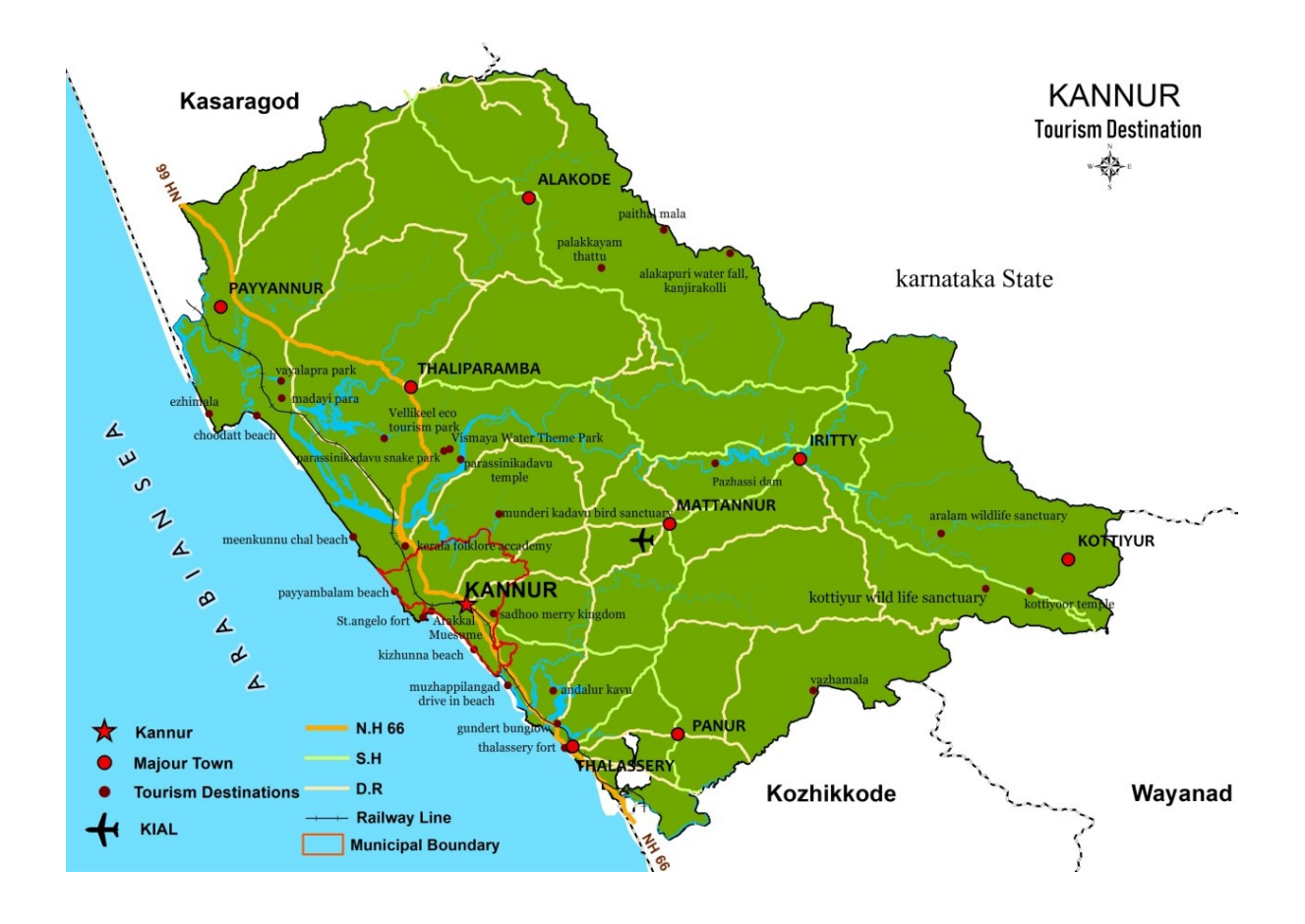
Figure.10.3 Important Tourist Locations in Kannur District

station. This beach is famous for its flat laterite cliffs that just into the sea. The well laid gardens and the massive landscaped mother and child sculpture make it extremely captivating. The beach has been pictured in many south Indian movies also.