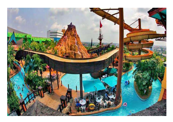
Vismaya Water Theme and Amusement Park

It is situated near to the famous Muthappan <u>t</u>emple in Parassinikadavu. It was officially inaugurated in August 2008 and since then it has become one of the favourite holiday destinations in Malabar.