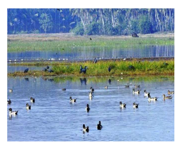
Munderi Kadavu Bird Sanctuary

It is a Biodiversity rich wetland area located about 14 km away from Kannur bus stand. This area is famous for migratory birds. Munderi Kadavu is a part of Katampally Wetlands which comprises nearly 4000 acres of marshland, used for paddy cultivation known as 'Kaippad'.